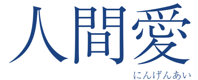
"Education through Ningen Ai (Empathy for All Humanity)"

Bunkyo University is guided by the spirit of "Education through Ningen Ai (Empathy for All Humanity)," which implies encouraging love for others and leads to enthusiasm for learning. Under this watchword, Bunkyo University is currently engaged in a complete evaluation of its programs. The reason for this basic reassessment is the rapidly changing role of Japan in the world, and a belief that higher education should take leadership in preparing youth for the opportunities presented in this age of information technology and global exchange. At this early stage in the process of evaluation, internationalization has already begun.